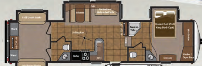
345DBQ LENGTH: 38' 3" WEIGHT: 11,682 HITCH: 2,355