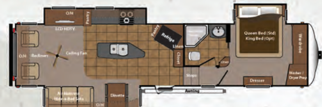
NEW! 358RLT LENGTH: 37' 7" WEIGHT: 11,460 HITCH: 2,055