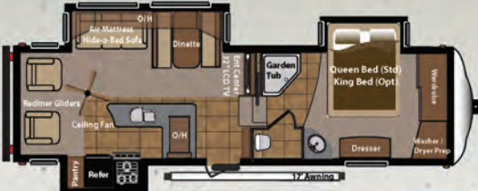
290RLT LENGTH: 31' 7" WEIGHT: 9,785 HITCH: 1,980