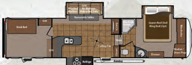
NEW! 357THT LENGTH: 38' 1" WEIGHT: 11,230 HITCH: 2,585