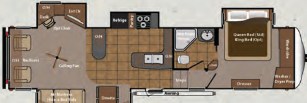
NEW! 362RLQ LENGTH: 37' 7" WEIGHT: 11,570 HITCH: 2,055