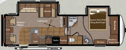
285RLD LENGTH: 31' 7" WEIGHT: 9,470 HITCH: 2,105