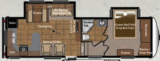
295RKD LENGTH: 33' 3" WEIGHT: 9,780 HITCH: 2,200