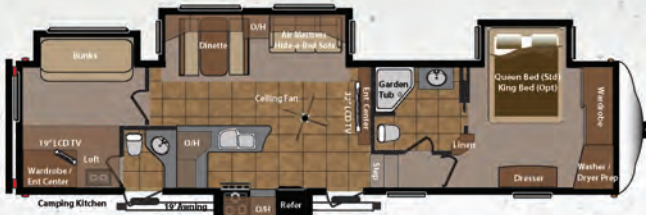
346LBQ LENGTH: 38' 3" WEIGHT: 11,830 HITCH: 1,935