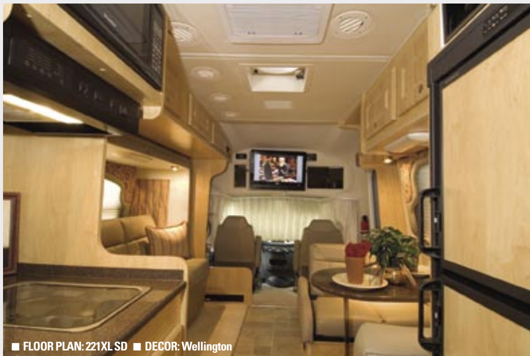
■ FLOOR PLAN: 221XL SD ■ DECOR: Wellington

Add the fully equipped kitchen and luxurious bath, and you have all the comforts of a full-size motorhome in a maneuverable, fuel-efficient vehicle. All this, with the longest list of standard features in the industry. That's the Coach House difference.