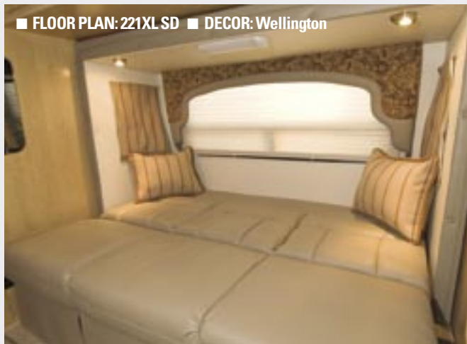
■ FLOOR PLAN: 221XL SD ■ DECOR: Wellington

ABOVE: View from the rear shows spacious living area with dinette (right) and power sofa/bed (left).